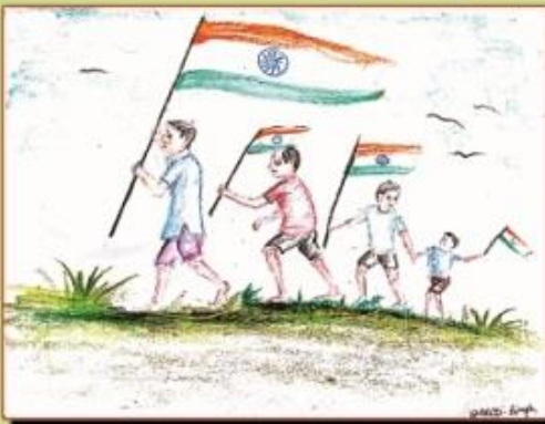
Aditi Singh Class III B